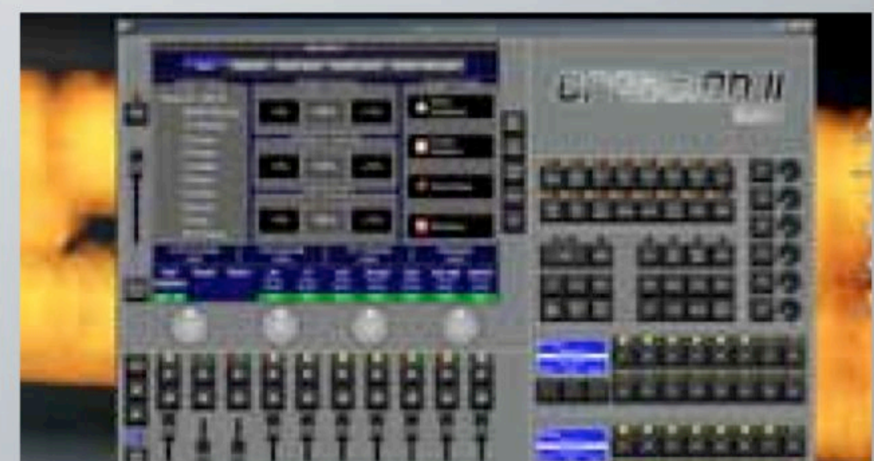
CREATION II - ONPC