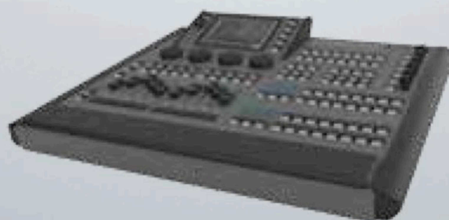
CREATION II - 1024