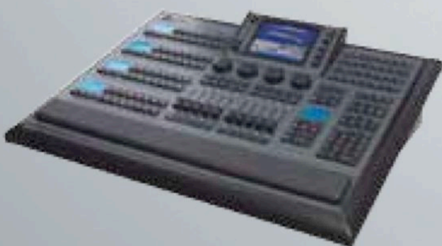
CREATION II - 4096