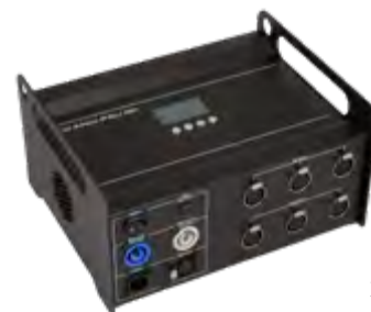
X4 atom PSU 6 Art.Nr.: 767102