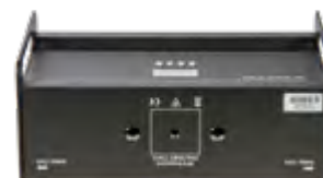
X4 atom PSU 12 Rückseite