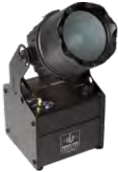
Free Connect IP65 Battery-Pack with CRMX