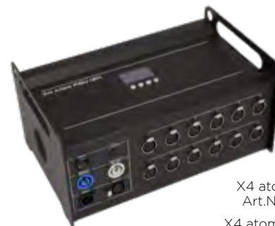
X4 atom PSU 12 Art.Nr.: 767101 X4 atom PSU 12 RM Art.Nr.: 767170